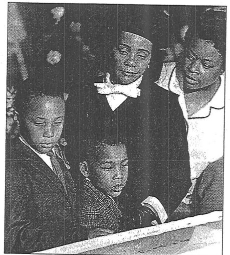
Grieving: King, center, and family in 1968